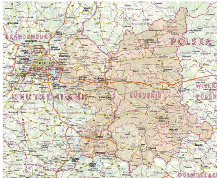
Fig. 2 German-Polish interaction area